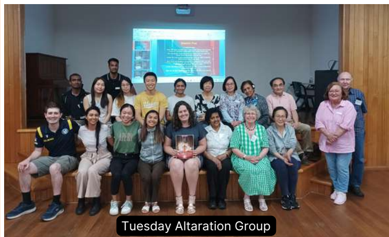
Tuesday Altaration Group

Please contact the Parish Office for more information